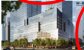
1 Journal Square | Two 64 story towers | 900 units (Kushner) Multiphase project Phase 1: broke ground June 2022, completion est. end of 2024