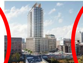
425 Summit Ave | 26 stories | 400 units (Spitzer Enterprises) Under construction Completion estimated end of 2024