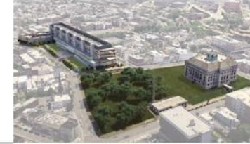
Hudson County Courthouse + Park Multiphase project Courthouse: under construction, completion estimated end of 2024 Park: Design started summer 2022