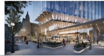
80 Journal Square | 28 stories | 400 units BH3 Management and Hope Street Capital