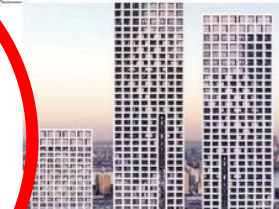
Journal Squared | 54,70,60 stories 1,200 units (KRE) Multiphase project Towers 1+2 completed Tower 3 completion est. 2023