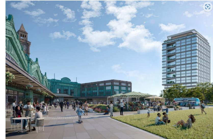
The project, dubbed Hoboken Connect, focuses on Hoboken Terminal, Lackawanna Plaza, and three properties just north of NJ Transit's rail tracks.