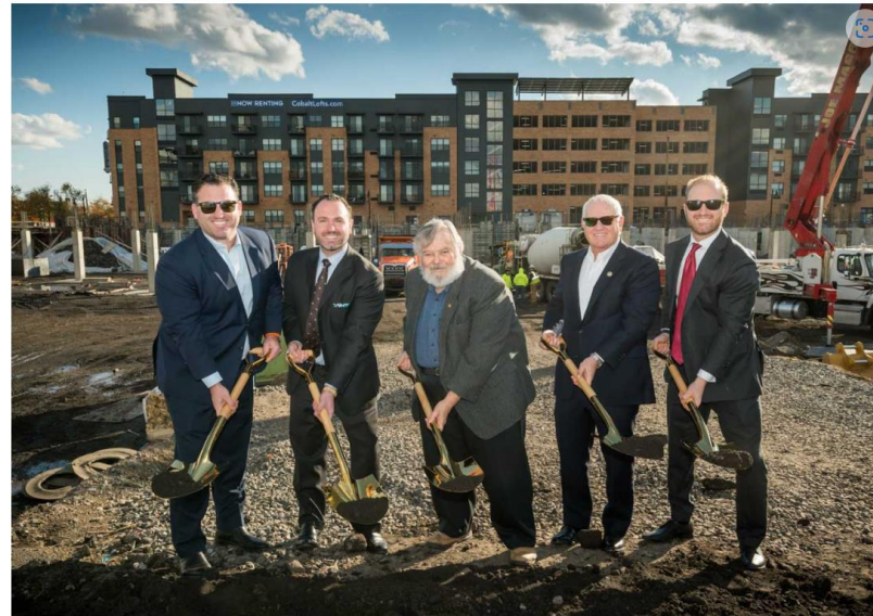
Groundbreaking for "Block D" at 1100 South 5th Street in Harrison, N.J.