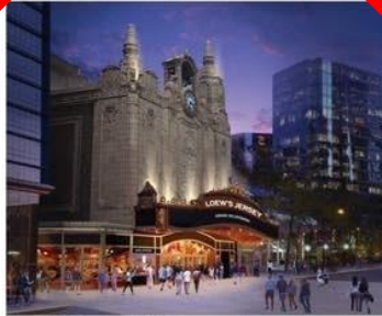
Loew's Theater | $72M renovations 3,330 seat performing arts center Anticipated opening: 2026