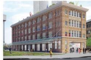
Pompidou x Jersey City World class museum Anticipated opening: 2026