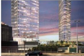
808 Pavonia | 52 stories | 1,200 units (KRE/Silverstein) Multiphase project Phase 1: estimated construction starts 1st Qtr 2023, completion estimated end of 2025