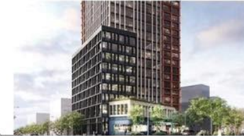
532 Summit | 25 stories | 340 units (Urby) Under construction Completion estimated end of 2023