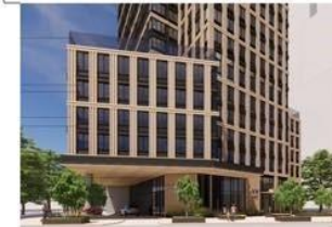
499 Summit | 53 stories | 600 units (Panepinto Properties) Construction to start early 2023 Completion estimated end of 2025