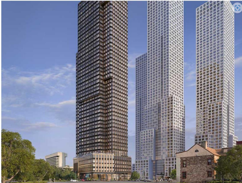
Latest rendering of Pathside Tower.