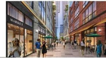
Homestead Place | 20-30 stories | ~3,000 units (Namdar Group, Lions Group, Oestricher/Nasser) Multiphase project 2 phases estimated complete in 2023