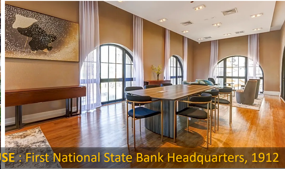
ADAPTIVE REUSE : First National State Bank Headquarters, 1912